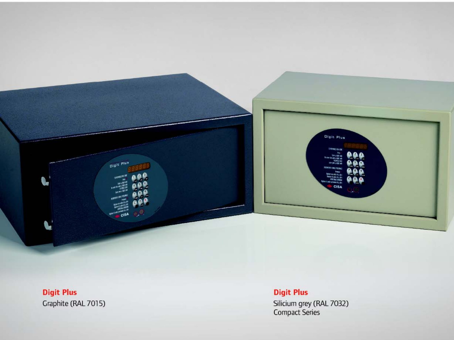
Digit Plus Graphite (RAL 7015)